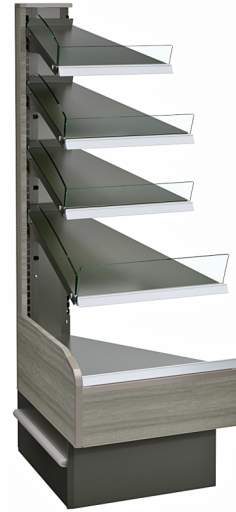
SHSW3065A.7819 Shown With Optional Bumper, End Panel & Product Retainer